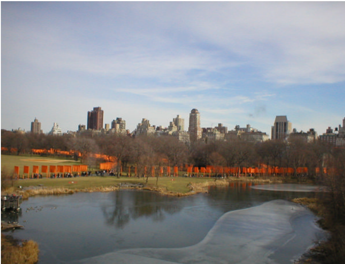
“The Gates,” Central Park, NYC