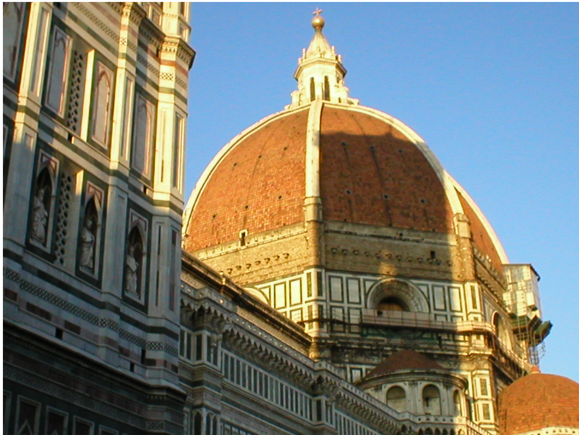
Bruneschellis's Dome, Florence, 2002

Save the Date: Visiting Professor Dinner Thursday, October 23, 2003